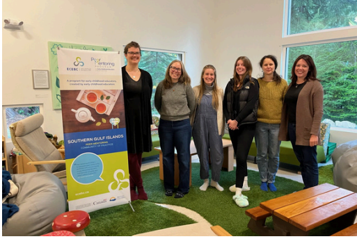
PMP gathering on the unceded traditional territories of the WSÁNEĆ people, who are part of the Coast Salish First Nations.