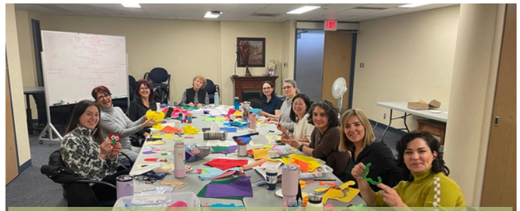
NORTH VANCOUVER: FELT STORIES