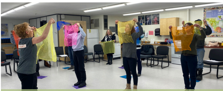
BULKLEY VALLEY: BRAIN DANCE MOVEMENT