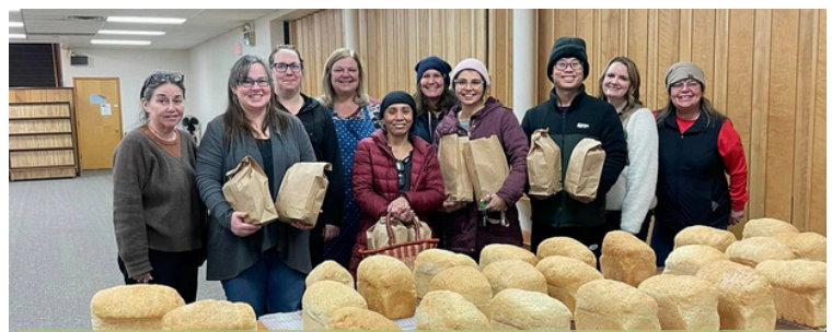
WEST KOOTENAY: GIFTING BREAD