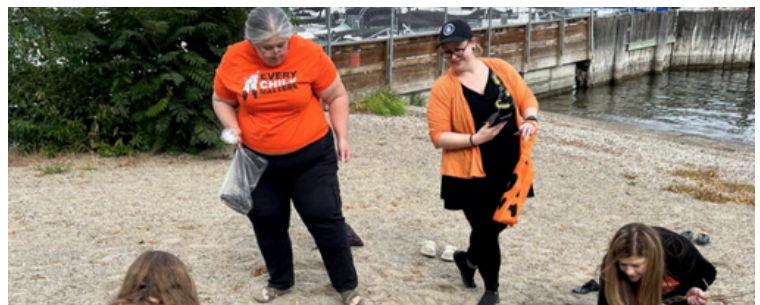
WEST KELOWNA: LEARNING ON THE LAND