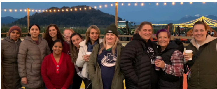
ABBOTSFORD: MAZE ADVENTURES