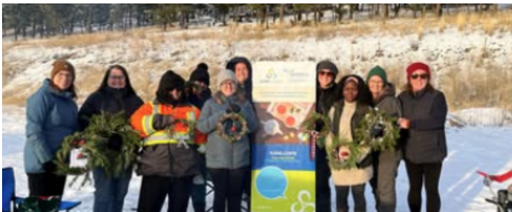
KAMLOOPS: OUTDOOR CONNECTIONS

Submit your photos (with consent to share) to peermentoring@ecebc.ca