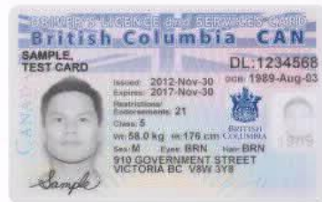
BC Services Card