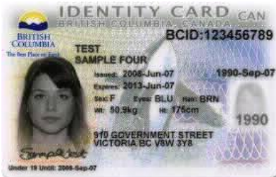
BC Identity Card