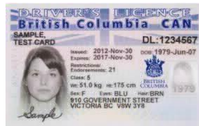
BC Driver's License