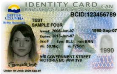
BC Identity Card