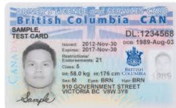
BC Services Card

To learn more about obtaining a BC Identity Card, please click here .